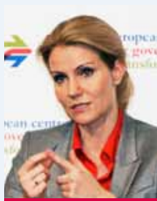
Helle Thorning-Schmidt, prime minister of Denmark