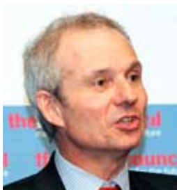
David Lidington, minister for Europe, United Kingdom