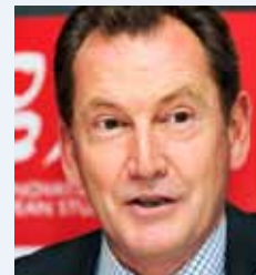
Graham Watson, member of the European Parliament