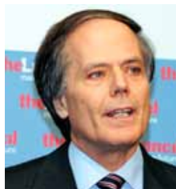
Enzo Moavero Milanesi, minister for Europe, Italy