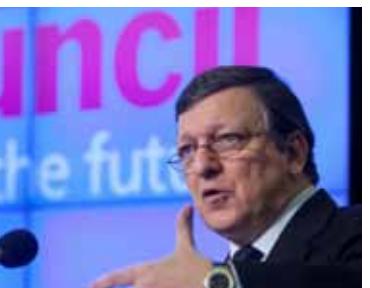
José Manuel Barroso, president, European Commission