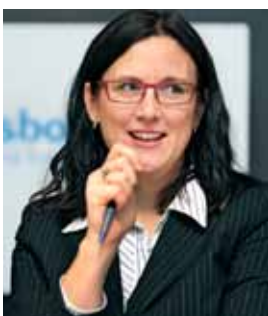
Cecilia Malmström, European commissioner for home affairs

Cecilia Malmström, European commissioner for home affairs, keynoted a High-Level Roundtable on Internal Security . With concern over immigration and terrorism mounting, the discussion focused on how digital technologies and modern communication systems can lead to better-managed, more secure organisation of interior policy. In times of budgetary constraints, special emphasis was placed on smart and cost-efficient solutions, building on existing European networks and collaborations. At the heart of the debate was the issue of how to treat third-country nationals, making legal access easier and more expedient – especially important in the inter-connected world of today where seasoned professionals move in and out of places to fulfil special assignments. The reality of 27 different systems can be a stumbling block to facilitate movement of people, creating legal uncertainties and causing redtape for all parties involved. There was consensus among participants that vast improvements to the current system are possible, yielding untold benefits for citizens and ultimately leaving Europe and Europeans more secure.