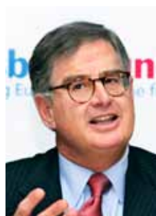
Samuel J. Palmisano, chairman, IBM