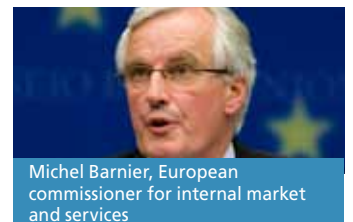
Michel Barnier, European commissioner for internal market and services

Michel Barnier, European commissioner for internal market and services, will deliver The 2012 Ludwig Erhard Lecture at The 2012 Single Market Entrepreneurs Summit . The Lisbon Council will launch SMEs in the Internal Market: A Growth Agenda for the 21 st Century , a new publication, in the margins.