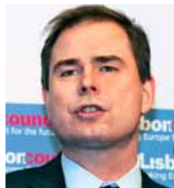
Nicolai Wammen, minister for European affairs, Denmark