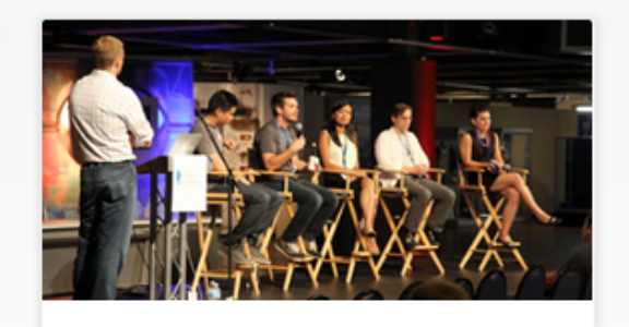
Participate in a local event

Check out the newest episode in our "Tools for Entrepreneurs" series. This week's video is a