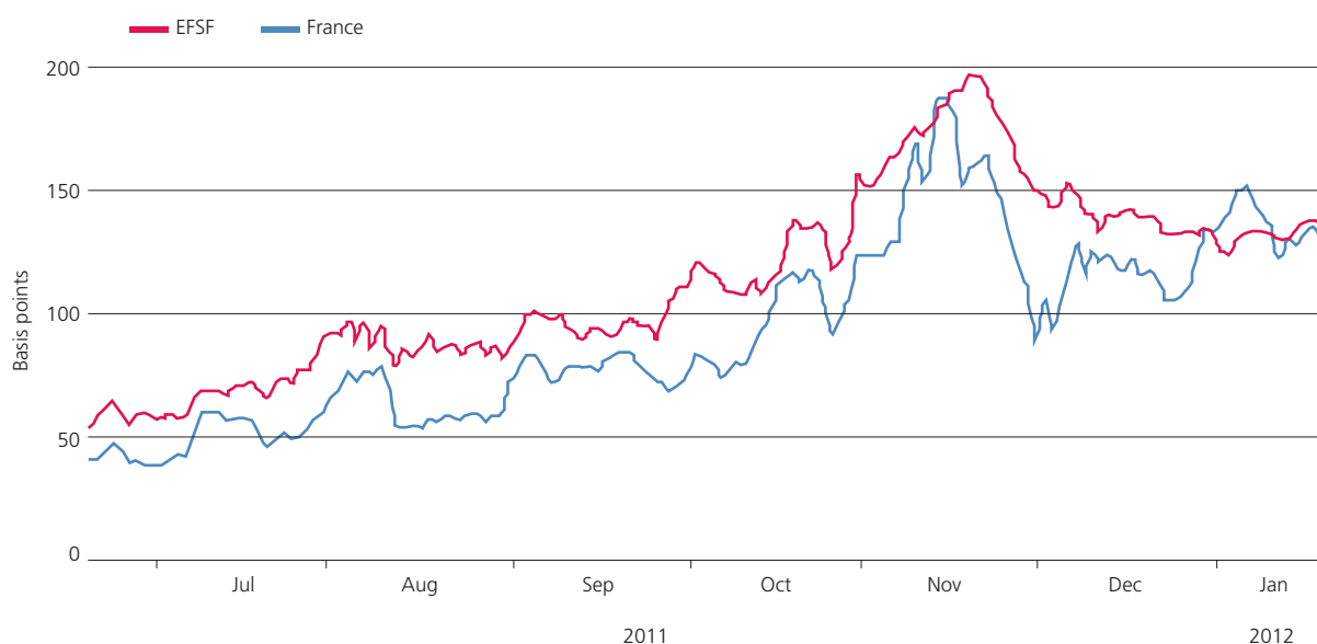
Chart 1: EFSF Bond Spread

else, such as the current European Financial Stability Facility (EFSF). Such difficulties of self-insurance for the eurozone became apparent in the course of 2011, as steps to bolster the EFSF faltered, and came to a head with Standard & Poor’s downgrades of some of the facility’s AAA guarantors and, ultimately – in a cascading domino effect – of the EFSF itself in January 2012. As a result, the spread of EFSF bond yields over equivalent German bunds has been well in excess of 100 basis points since October 2011 – more than double the level prevailing in the summer of 2011, and generally slightly above that of France (see Chart 1 below for a look at the widening yield spread of EFSF and French bonds over German bunds since June 2011).