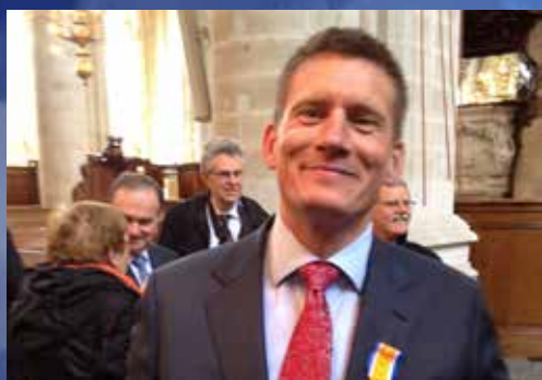
Tjark de Lange

An award-winning journalist and writer who previously worked at The Wall Street Journal , Time and Fortune .