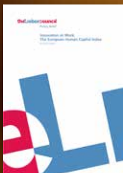
Innovation at Work: The European Human Capital Index Peer Ederer