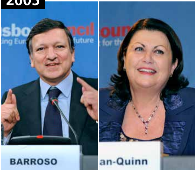
José Manuel Barroso (2005), president of the European Commission, and Maíre Geoghegan-Quinn (2010), European commissioner for research, innovation and science, deliver their first major policy speech in Brussels at the Lisbon Council.