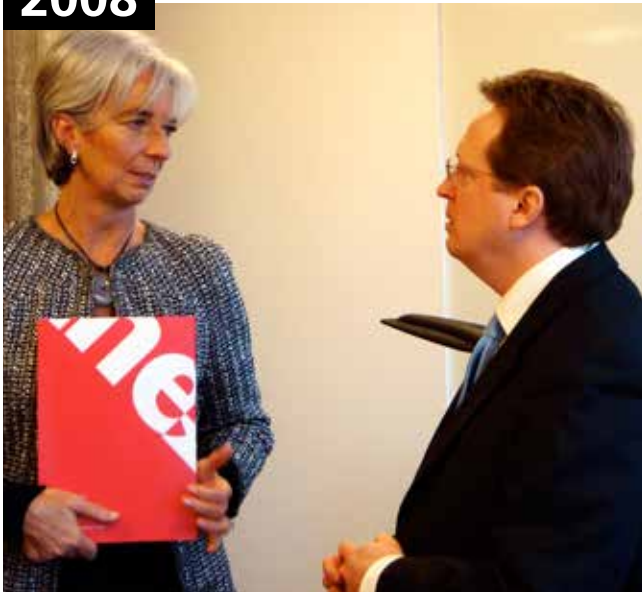
Bilateral meeting with Christine Lagarde , then French minister of economic affairs, finance and employment, in the margins of the Lisbon Co-ordinators meeting.