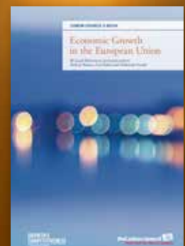
Economic Growth in the European Union Leszek Balcerowicz