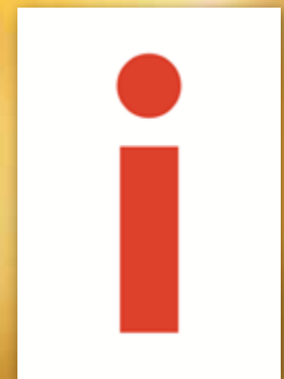
Plan I(nnovation) for Europe: Delivering Innovation-Led, Digitally-Powered Growth