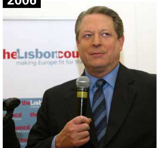
The Lisbon Council hosts the Belgium premiere of An Inconvenient Truth , the seminal film by Al Gore , chair of the Alliance for Climate Protection and former vice-president of the United States.