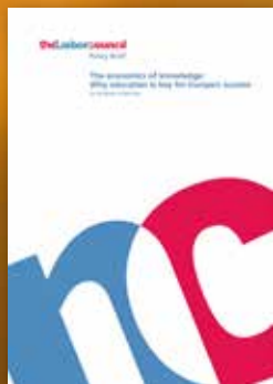
The Economics of Knowledge: Why Education is Key to Europe's Success Andreas Schleicher

The hallmark of Lisbon Council research is that it not only analyses problems but also focuses on solutions, engaging some of the world's best and brightest minds to offer their expertise and experience. The Lisbon Council is credited with calling on policymakers to broaden their understanding of what drives competitiveness, being among the first to highlight the importance of skills and human capital and the sustainability of public finances. Today, the organisation is at the forefront of major research projects, defining the success metrics of a digitally-connected, innovation-powered, and entrepreneurial-driven society and economy.