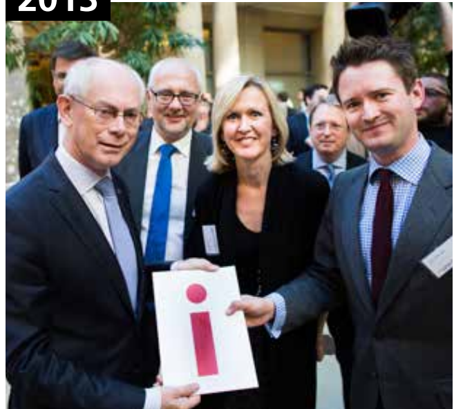
The Lisbon Council welcomes Herman Van Rompuy , president of the European Council, at the launch of Plan Innovation for Europe , a joint publication with Nesta.