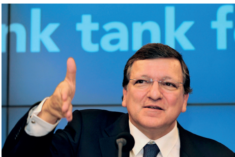
José Manuel Barroso