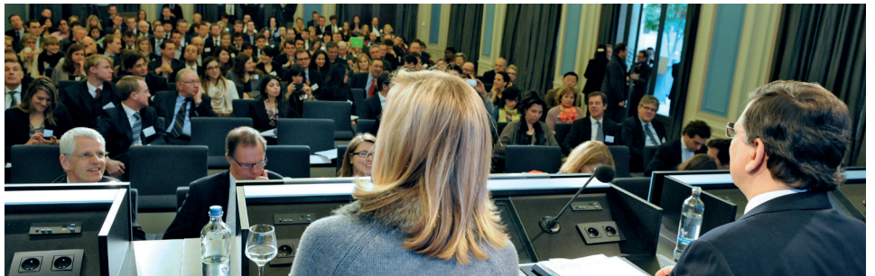
Europe 2020 Summit