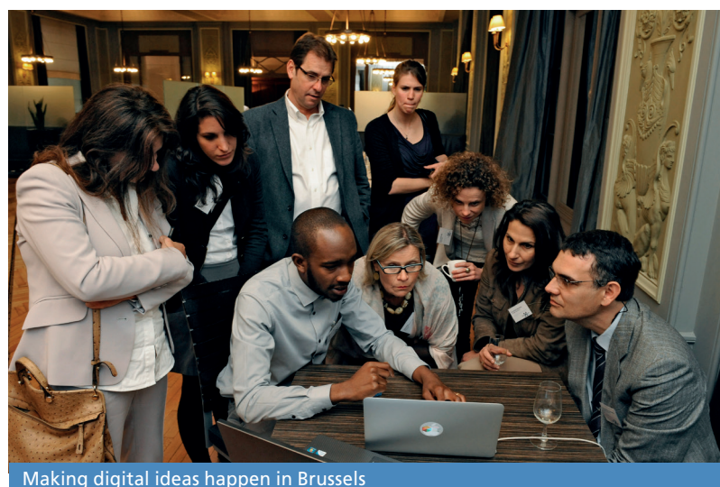
Making digital ideas happen in Brussels