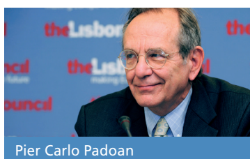
Pier Carlo Padoan