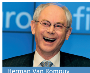
Herman Van Rompuy