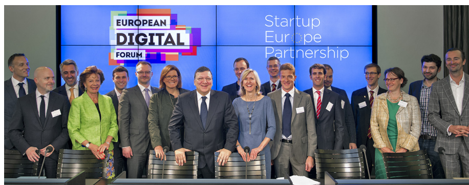
José Manuel Barroso and Neelie Kroes join leaders from the European Digital Forum and the Startup Europe Partnership communities at the Brussels launch