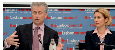
Robert Madelin and Kaja Kallas

The Lisbon Council convened the High-Level Roundtable on New Frontiers for the App Economy and Mobile Internet: Creating Value and Improving Lives in Europe . Kaja Kallas, member of the European Parliament (ALDE-Estonia); and Robert Madelin, then director-general at DG Connect, joined a high-level panel to discuss how the spread of new types of applications and mobile computing is improving lives and wellbeing. Download All About that App , a new study released by Plum Consulting on the occasion.