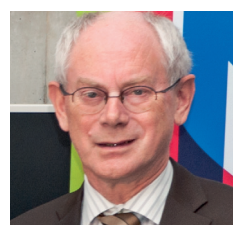
Herman Van Rompuy