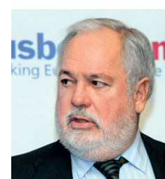
Miguel Arias Cañete

As the European Commission finalised the Energy Union package, the Lisbon Council convened The 2015 Energy Union Summit . Miguel Arias Cañete, European commissioner for climate action and energy, and Kandeh Yumkella, UN under-secretary-general, delivered keynotes. The debate was intellectually informed by The 2015 Energy Productivity and Economic Prosperity Index: How Efficiency Will Drive Growth, Create Jobs and Spread Wellbeing Throughout Society , a year-long study jointly written by the Lisbon Council, Ecofys and Quintel Intelligence, two leading climate and energy modeling agencies. Download The 2015 Energy Productivity and Economic Prosperity Index .