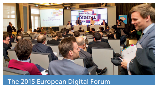
The 2015 European Digital Forum