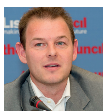
Daniel Dalton, MEP