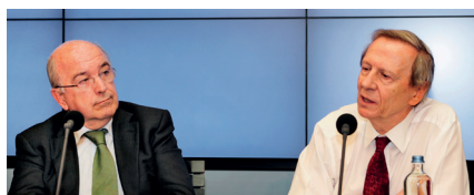
Anthony Giddens, right, and Joaquín Almunia, vice-president of the European Commission