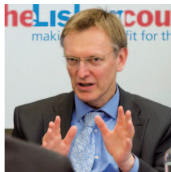
Janez Potočnik, European commissioner for environment

On the eve of the spring European Council, where government leaders discussed the key goals for the Europe 2020 Strategy, the Lisbon Council convened its Eco-Innovators Network under the theme of Europe 2020: Resource Efficiency as a Driver of Sustainable Growth and Jobs . Janez Potočnik, European commissioner for environment, opened the debate by