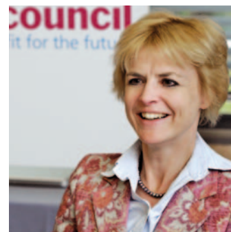
Lykke Friis, minister of energy and environment, Denmark

delivering The 2010 Jean Jacques Rousseau Lecture , using the occasion to make a compelling call not to water down Europe's environmental ambitions in view of the global economic crisis. Jules Kortenhorst, CEO of the European Climate Foundation, led an afternoon workshop on Roadmap 2050: A Practical Guide for a Low-Carbon Europe . In a separate event, Lykke Friis, Danish minister for climate and energy, joined the Lisbon Council for a High-Level Working Lunch on the EU Energy Action Plan, as well as the forthcoming Danish EU Presidency in the spring of 2012. Watch Commissioner Potočnik's lecture as well as interviews with Lykke Friis and other leading eco-innovators on the Lisbon Council website at www.lisboncouncil.net/ecoinnovation .