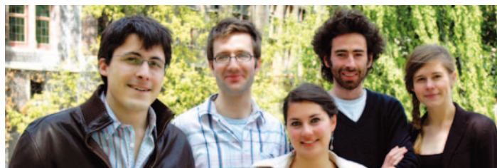
These College of Europe students won the 'European Excellence Award' for their case study on outpatient care at Barcelona Hospital Clinic