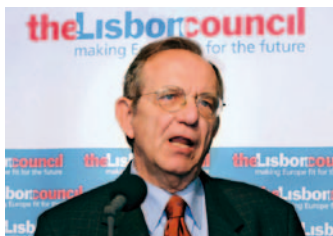
Pier Carlo Padoan, deputy secretary-general and chief economist, OECD

In the run up to the June European Council, the Government of the Future Summit was organised by the Lisbon Council, in collaboration with the College of Europe and Accenture. It brought together senior government and civil service leaders to explore key themes such as innovation in the public sector and providing more and better services despite strained government finances. The summit was kicked off by Pier Carlo Padoan, deputy secretary-general and chief economist of the OECD, who delivered The 2010 Jean Monnet Lecture on The Challenge of State Transformation in the Post-Crisis Era . The summit also launched a new publication, Building a Better Future in an Age of Transformation , which summarised four case studies on state modernisation prepared by College of Europe students. Download Pier Carlo Padoan's presentation and the case studies' final report on the Lisbon Council website at http://www.lisboncouncil.net/governmentoffuture .