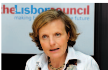
Paola Testori Coggi, director-general of DG Health and Consumers, European Commission

Convening as part of the Government of the Future Centre , this high-level workshop explored the current trend of putting the patient at the heart of healthcare provision. Paola Testori Coggi, director-general of DG health and consumers at the European Commission, presented priorities of the new European Commission for transforming the healthcare system. During a session on Patient-Centred Healthcare: New Approaches and Technologies Enabling More Effective Healthcare , decision makers and top-level practitioners from throughout Europe presented national success stories and best practices. The discussion focused in particular on how more extensive and smarter use of ICT can lead to better outcomes for patients and healthcare providers, and addressed the issue of more co-creation and collaborative innovation in the health system.