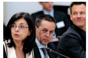
Meglana Kuneva, chair of High-Level Public Service Network and former European commissioner