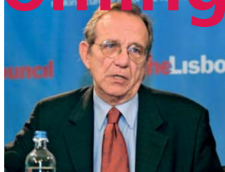
Pier Carlo Padoan