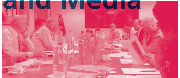
Brainstorming session with Vice-President Verheugen