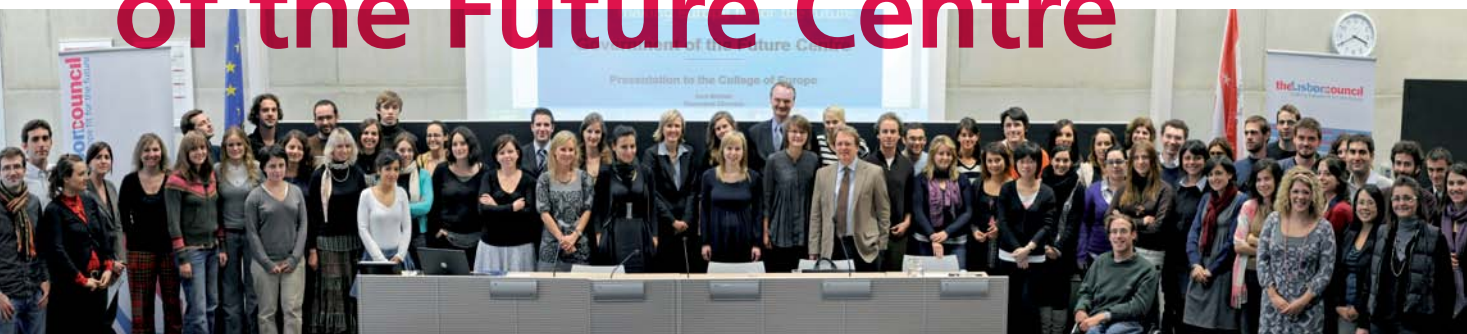
Students from the College of Europe take part in the Government of the Future Centre