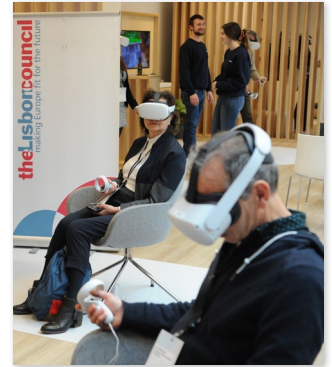
Exploring the Metaverse